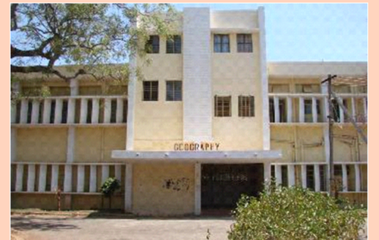
DEPT. OF GEOGRAPHY